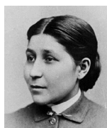
Dr. Susan La Flesche Picotte

Nebraska physician who attracted worldwide attention for being the first physician to use an airplane to perform emergency surgery.